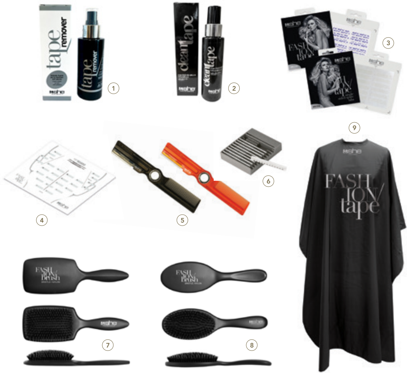
1. TAPE REMOVER ART.NR: 90671