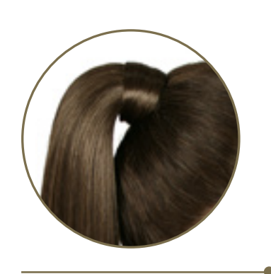
PONY TAIL - info