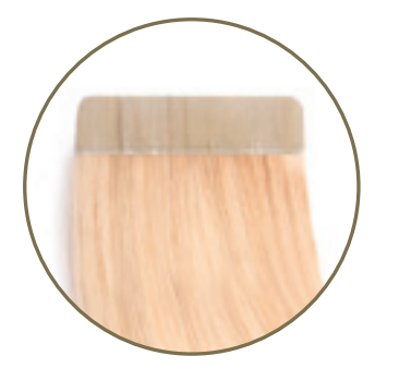
FASHION TAPE - basic

/ color-effects for endless creative possibilities